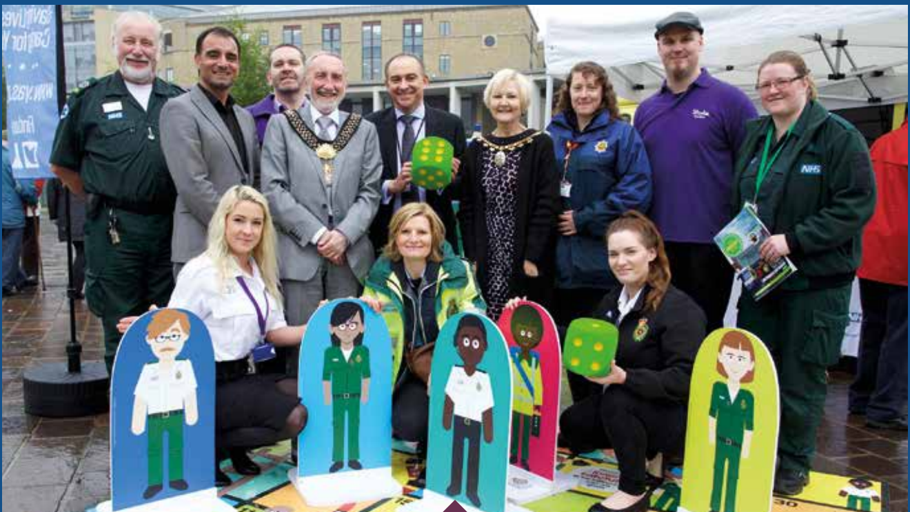
The summer roadshow at Bradford's Centenary Square in May