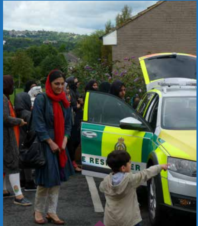
Exploring YAS vehicles at the Al Mahdi Mosque Family Fun Day

The free First Aid Awareness training courses continue to offer members and local community groups the opportunity to learn key live-saving skills. Last year we delivered 135 courses, reaching around 2,900 participants, including adults and children with learning disabilities, college students, army cadets, primary and junior school children, Scouts, Beavers, Cubs, Brownies and Girl Guides, the Leeds Migrant Access Project, Sikh Gudwara Temple and the Leeds travelling community.