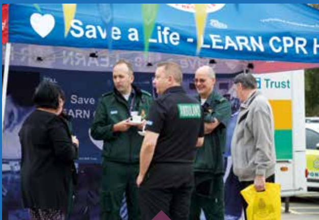
YAS staff speaking to members of the public at the Scarborough Roadshow