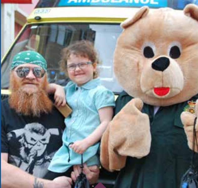
YAS Mascot, ParaTed, on hand to meet children at the Scarborough Roadshow